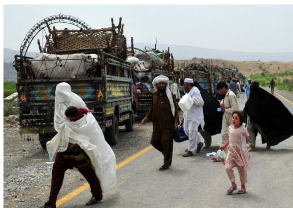
Returning families load their household belongings in trucks in Tank district. KP.

According to FATA Disaster Management Authority (FDMA), over 120,000 1 families are still displaced from FATA and are residing in districts of Khyber Pakhtunkhwa (KP) and FATA. During the displacements starting 2008, over 284,000 families were registered with the Government authorities, out of which nearly 97,000 have returned. The figures do not include the IDPs from Malakand division in KP, where almost all of IDPs have returned.