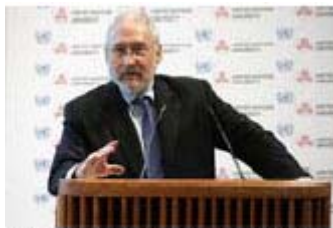
Nobel Laureate Joseph E. Stiglitz at UN Headquarters in February 2009

"As this is a global crisis, a small group of industrialized countries are ill-equipped to deal with it," he said.