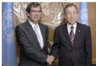
New Special Envoy for Assistance to Pakistan, Jean-Maurice Ripert (left), with Secretary-General Ban Ki-moon (File photo)

24 August 2009- Secretary-General Ban Ki-moon has appointed the current French Ambassador to the United Nations as his Special Envoy for Assistance to Pakistan, a newly-created position, it was announced today.