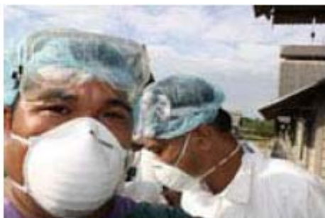
Global alarm as influenza A(H1N1) virus spreads

19 August 2009- The United Nations health agency is providing practical information and technical expertise to countries in South-East Asia to help reduce panic and encourage prevention against the influenza A(H1N1) virus, which has already claimed over 80 lives in the region and continues to spread.