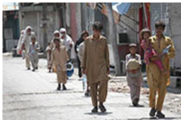
Returning families walk past closed shops, other buildings in Swat District in Pakistan's NWFP

education and health were of the highest importance, according to a news release issued by the Office for the Coordination of Humanitarian Affairs (OCHA).