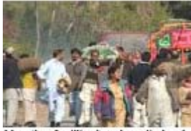
More than 2 million have been displaced by renewed fighting in Pakistan's North West Frontier Province

Over half of the returnees went back to the districts of Swat and Buner, among the areas hardest hit by the fighting, while the rest returned to Dir and Shangla districts.